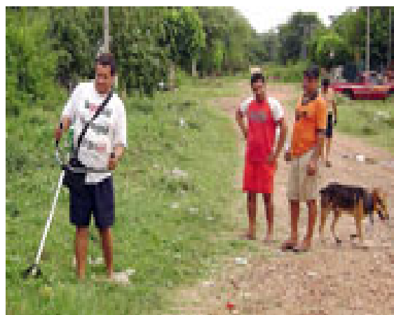
Neighbours in the Central area of Roque Alonso have started clean-up activities.

<click here for contact details, or here to view the map of the affected area>