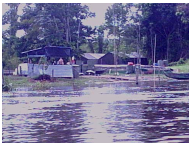
Floods in the Southern region of Suriname.

<click here for the DREF budget, here for the map, or here for contact details>