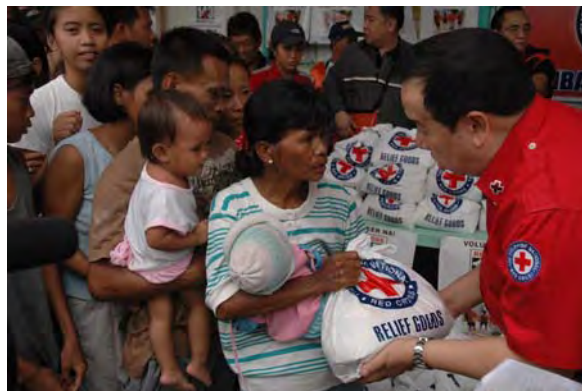
Philippine National Red Cross officials help in the distribution of relief items to communities affected by Typhoon Morakot.

PNRC staff and trained volunteers from the various chapters have been assisting various people affected by floods over the last months due to the monsoon rain and as a result of the various typhoons that have passed through the Philippines. Since 6 August, hundreds of volunteers have been mobilized in the various flood-affected parts of the country to assist in search-and-rescue operations, providing first aid to the injured, distributing food and non-food relief items, and assessing needs in the areas of health, water and sanitation. PNRC emergency response unit (ERU) teams have been dispatched to the various locations to assist the chapters. Food and non-food items from the PNRC central warehouse have been dispatched to areas requiring assistance. Meanwhile the PNRC chapters themselves in the affected areas are procuring food and other essential items from their local funds. These chapters are also working in coordination with the local authorities and others on the ground.