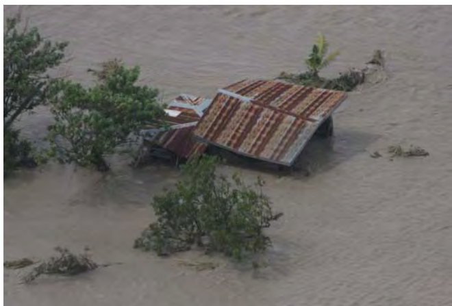
Typhoon Morakot displaced up to 18,618 families and destroyed as many as 57 homes in the Philippines. PNRC.

According to media reports on 8 August, seven people including three French tourists were killed when they were swept away by floods in Capas, Tarlac, while three boys died yesterday morning when their house was buried by a landslide in Bagio City after heavy rains spawned by Typhoon Morakot/Kiko hit