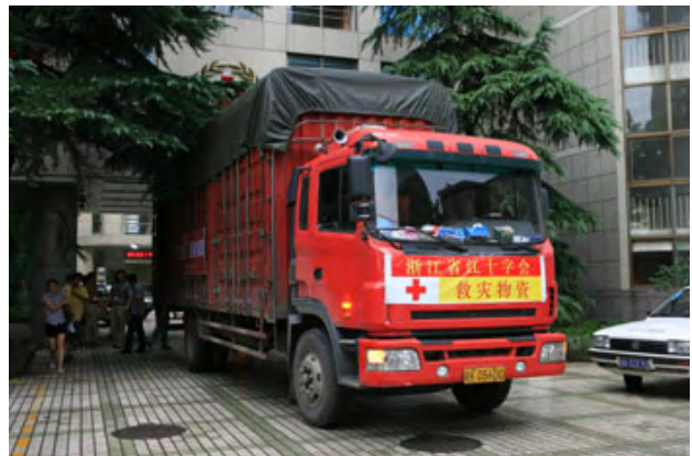
Relief goods sent out for the most affected areas in Wenzhou Zhejiang by Zhejiang Red Cross. Zhejiang Red Cross

<click here for a map of the affected areas, or here for detailed contact information>