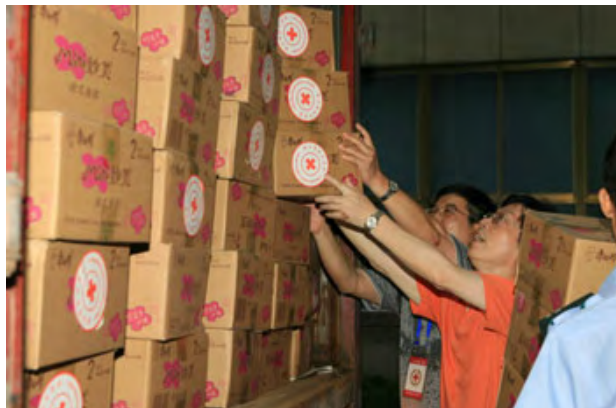
Relief goods sent out for the most affected areas in Wenzhou Zhejiang by.

RCSC and RCSC staff and members, the executive vice president of the RCSC shows her great concern to the affected people in Taiwan, salutes TRCO staff and members, and expressed willingness to strengthen the cooperation in disaster relief and humanitarian work. RCSC is willing to do its best to provide any possible support and help to TRCO respond to the disaster.