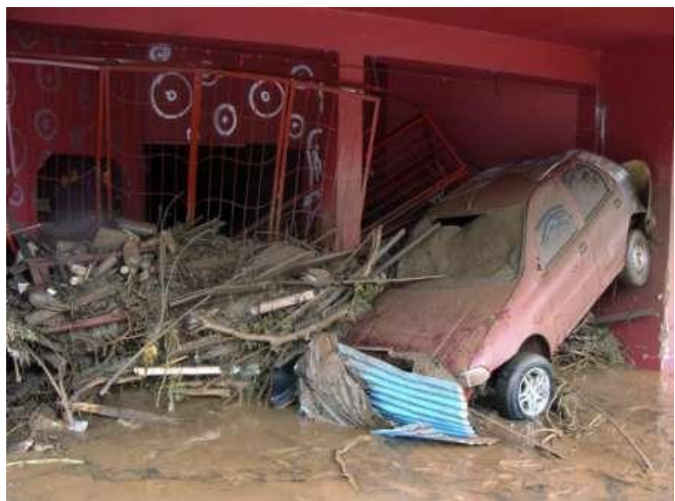
The city's infrastructure has been affected by the water, mud and wood remains from the Tartagal River.