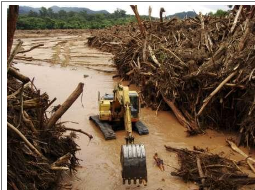
An excavator clears debris from the Tartagal River.

Tartagal has an approximate population of 60,000 inhabitants, out of which 20,000 people have been affected according to official reports. Figures from Argentine authorities indicate that 742 people have been evacuated and placed in four temporary shelters. 1,200 people self evacuated, 2 people are missing and 2 people have died. The most heavily impacted neighbourhoods were Santa Maria and a settlement located west from the railroad bridge, known as Barrio Saavedra. In addition, a high percentage of the urban area of the city was covered by mud, reaching at places up to 1.5 metres. Preliminary information on infrastructure damage indicates that 30 houses have been destroyed and 300 more damaged, along with other reported loss of personal and commercial property.