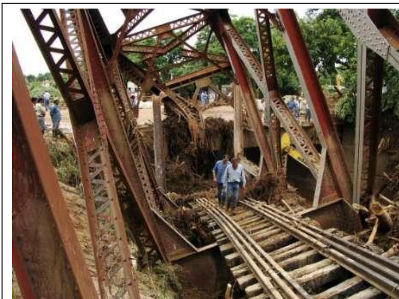
A bridge destroyed by the landslide in Tartagal, northern Argentina.

This operation is expected to be implemented over three months, and will therefore be completed by 13 May 2009; a Final Report will be made available three months after the end of the operation (by 13 August 2009).