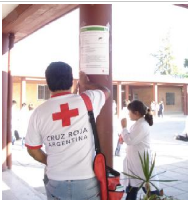
Argentine Red Cross volunteers placing posters in schools on dengue prevention measures.