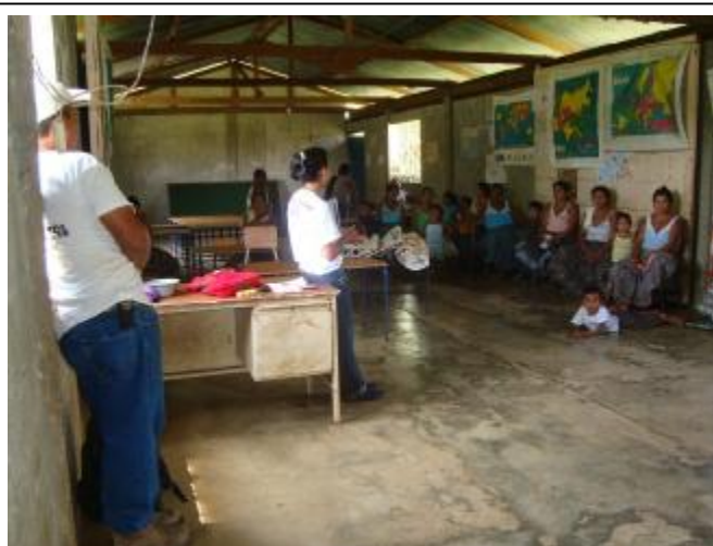
Preliminary identification of affected families carried out by Guatemalan Red Cross volunteers in the department of Izabal.

Summary: Since March 2009, the Guatemalan government has been implementing an emergency food assistance contingency plan. On 8 September 2009, the Guatemalan President declared a state of public calamity. There has been a high incidence of malnutrition resulting from the loss of crops caused by persistent drought and high food and fuel prices. According to the authorities, approximately 54,000 families reside in areas prone to extreme weather conditions. This DREF allocation will support the Guatemalan Red Cross in drawing up a plan of action based on findings from the assessments carried out.