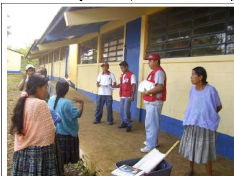
Guatemalan Red Cross volunteers in the department of Izabal identifying affected families.

NIT teams consisting of 50 people will be mobilized to perform the assessments in the areas where GRC branches are