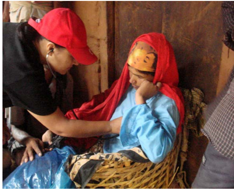
The Nepal Red Cross Society health team reached the affected district of Jajarkot to support the government's health agencies.

As an ex-officio member of the government's disaster management set-up, the Nepal Red Cross Society is part of the coordination mechanism in the country's capital, Kathmandu, as well as in the field. Red Cross volunteers have been mobilized to assist in the raising awareness in the remote villages while also providing care to the ailing.