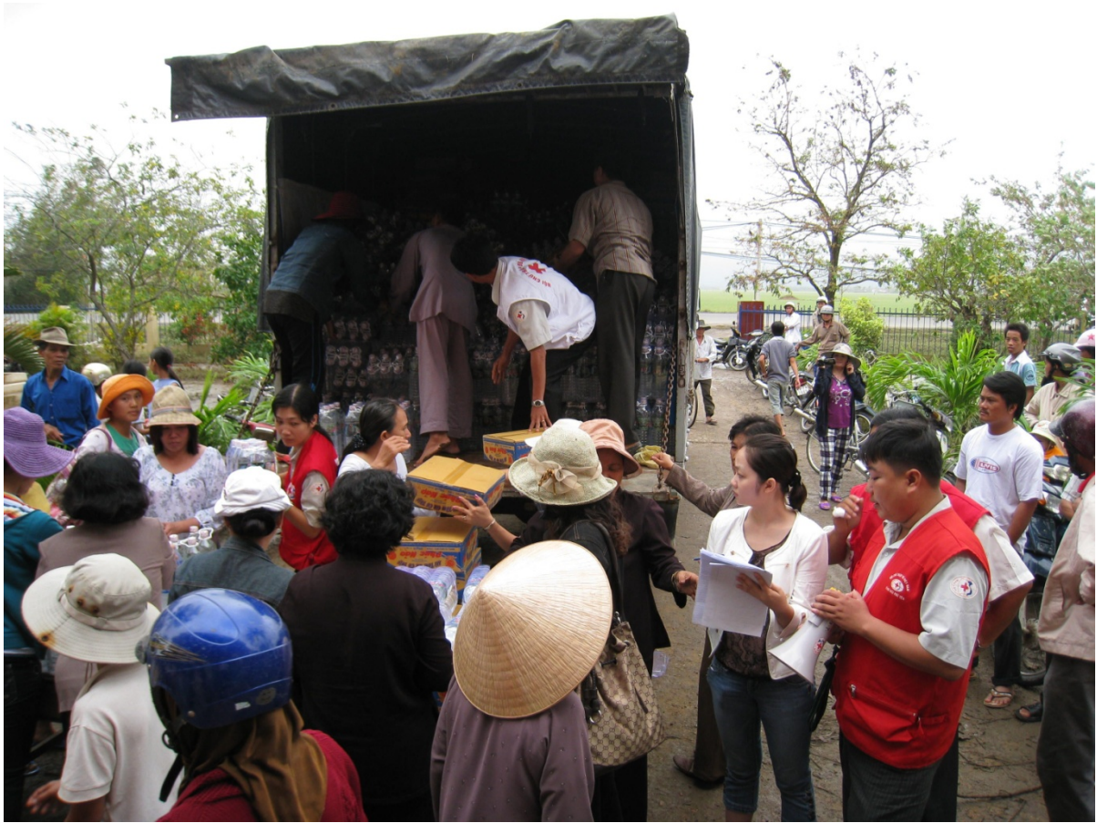
The Viet Nam Red Cross Phu Yen Chapter distributing food items to the people of Phu Yen following the onslaught of Typhoon Mirinae.

In Phu Yen, torrential rain started on the night between 2 and 3 November, and two hydroelectric lakes released water on 3 November, submerging the province. On the afternoon of 4 November, the districts of Tuy An, Dong Xuan, Tay Hoa, Phu Hoa, Dong Hoa and Tuy Hoa City were under water. Many communes have been isolated. Dozens of thousands of houses have been flooded, and thousands of people were isolated because of flooding.