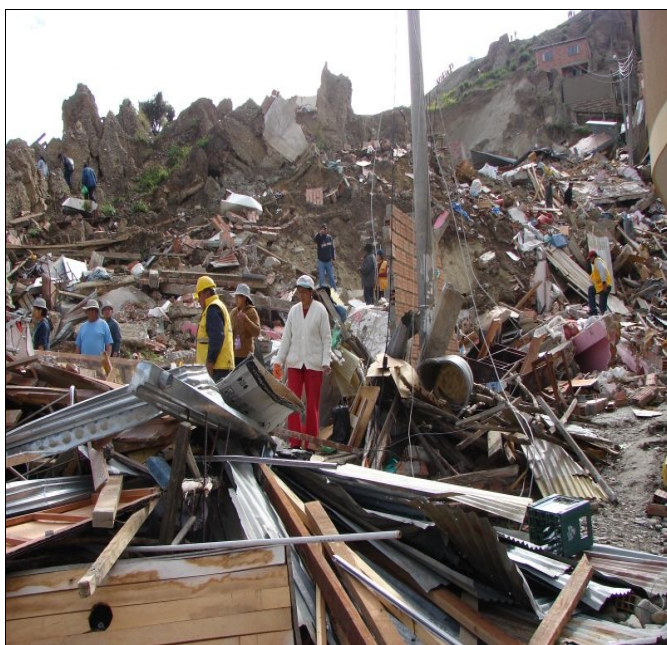
Landslides have destroyed more than 71 houses in the city of La Paz.

In the department of La Paz, several main rivers overflowed due to heavy rains, including the Chimore, Sajta, Chapare, Eterazama, Bolivar and La Paz rivers. In addition, on 28 January 2010, landslides destroyed at least 71 houses affecting 135 families and damaging an additional 62 houses. On 5 February 2010, another landslide affected approximately 67 people and 10 houses. Several communities in the northern region of La Paz sustained damages caused by overflowed rivers and floods.