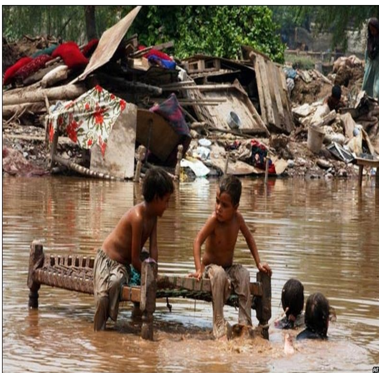
Children from the municipality of Villaroel have been affected by the floods, Department of Cochabamba.

This operation is expected to be implemented over three months, and will therefore be completed by 11 May 2010 a Final Report will be made available three months after the end of the operation (by 11 August 2010).