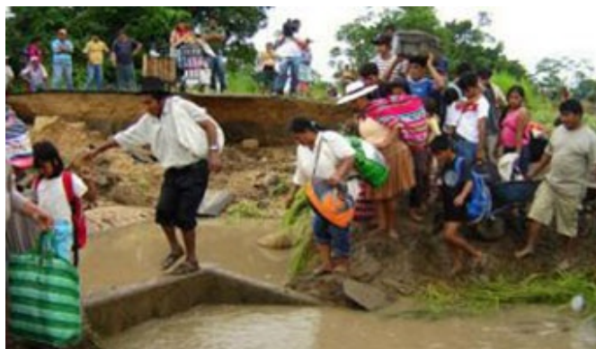
People in Bolivia have been forced to evacuate their homes carrying their belongings.

Since the onset of the emergency, inter-institutional meetings have been held in the National COE where the Bolivian Red Cross has been actively participating and sharing information among all the actors involved. The National Disaster and Relief Unit is participating in coordination initiatives and follow-up meetings with the National Civil Defence, the National Disaster Directorate of the Ministry of Health and international organizations in-country including PAHO, the World Food Programme and World Vision.