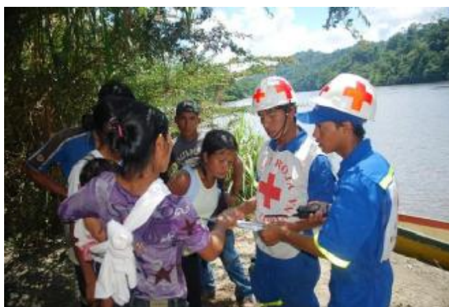
Ecuadorian Red Cross volunteers carried out assessments and beneficiary selection in the affected province of Napo.

<Click here for the DREF budget and map, here for contact details>