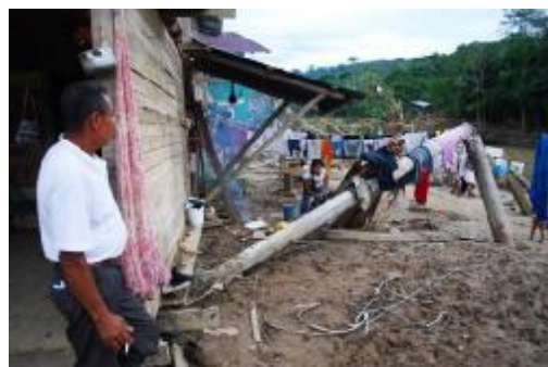
ERC volunteers carried out damage and needs assessments in the 12 communities from the Napo province.

All the 228 families identified by the Red Cross live in rural areas, where in most of the cases can only be reached through rivers. The inhabitants of these 12 communities are mainly from the quichua ethnic group, a population group already vulnerable before the disaster.