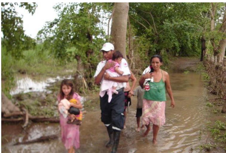
A family is evacuated from flooded areas with the support of an SRCS volunteer.

Summary: Heavy rains have been experienced in most of the country, specifically in the coastal areas, volcanic range and eastern and central areas of the country. The Directorate General of Civil Protection reports 9 deaths, 2 people missing, 3 injured, 8,717 evacuees and 8,119 people in 150 collective centres. The Salvadoran Red Cross Society volunteers and staff are focusing on search and rescue, pre-hospital care and damage and needs assessments.