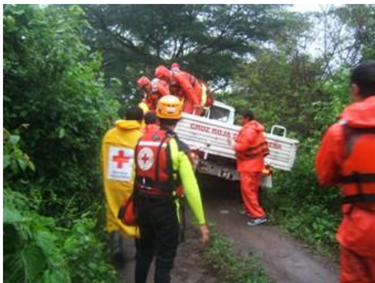
The Salvadoran Red Cross Society volunteers and staff are focusing on search and rescue, pre-hospital care and damage and needs assessments

The DREF allocation will provide direct assistance to 250 families (approximately 1,250 beneficiaries) and assist with damage and needs assessments.