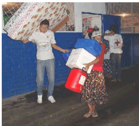
A woman received help from a SRCS volunteer to carry relief items received. She was affected by the flooding and rains caused by Tropical Depression Agatha.

Humanitarian aid has begun to be distributed by the SRCS to 9 collective centres in San Pedro Masahuat municipality – department of La Paz - for more than 180 families. The following has been distributed: