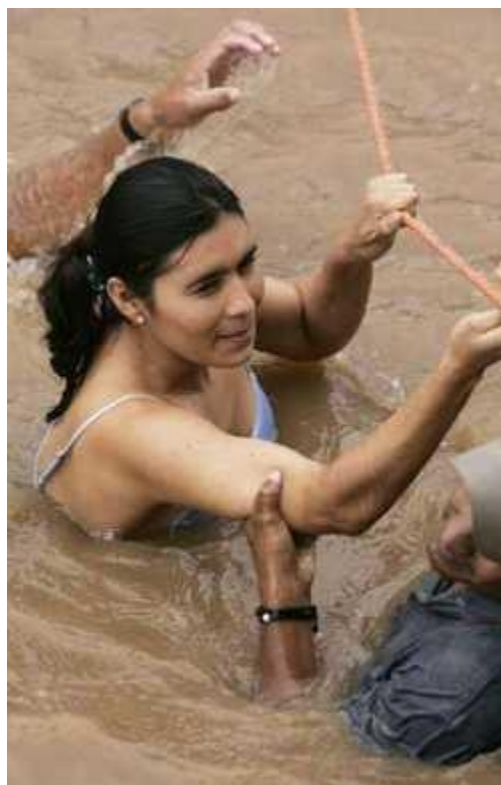
A woman uses a rope to cross the overflowing Huiza River in La Libertad, south of San Salvador, May 30 2010. The remnants of Tropical Storm Agatha dumped more rain on El Salvador.

Coastal area flooding and overflowing of rivers have been reported. The rivers that drain into the Bálamo mountain range toward the La Libertad coast and which have a high probability of overflowing are the Melara, El Jute, Chilama, Aquiquisquillo, Bocana San Diego, Bocana Toluca and El Muerto. In addition, the Lempa River, Grande San Miguel River, Goascorán River, Jiboa and Paz Rivers are being monitored.