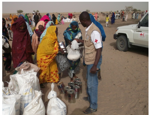
The RCC has distributed a three month ration of food targeting 5,000 malnourished children and their families. This supported short term beneficiary needs in areas where access to food is very difficult.

Low appeal coverage has limited implementing long-term solutions for beneficiaries in the field. The approach is to launch simultaneously relief and recovery activities to support beneficiaries to bounce back and cut the