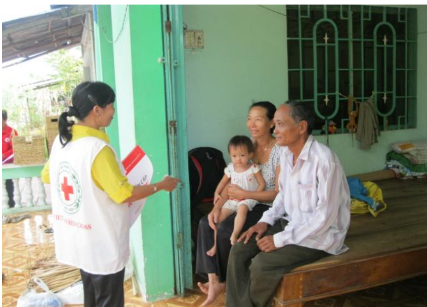
A Red Cross volunteer in Binh Hang Trung commune, Cao Lanh district, Dong Thap province visits a family with children under five to communicate preventive messages for hand, foot and mouth disease (HFMD) in January 2012.

There have been approximately 3,000 people, including mothers of children under five years, care givers, volunteers and representatives of local authorities, who participated in the public campaigns in the 18 target communes. The campaigns called for preventive actions such as safe water storage, hand washing, and environmental cleaning among other preventive messages. These campaigns were covered by local media in order to reach to a wider public audience in the theme of prevention of diseases.