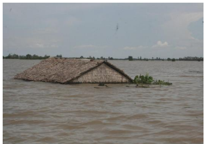
Long An was one the of the provinces worst affected by the Mekong Floods in 2011. Only rooftops were visible in some of the worst-hit communities.

According to the last update on 10 November 2011 on damages by the central committee for flood and