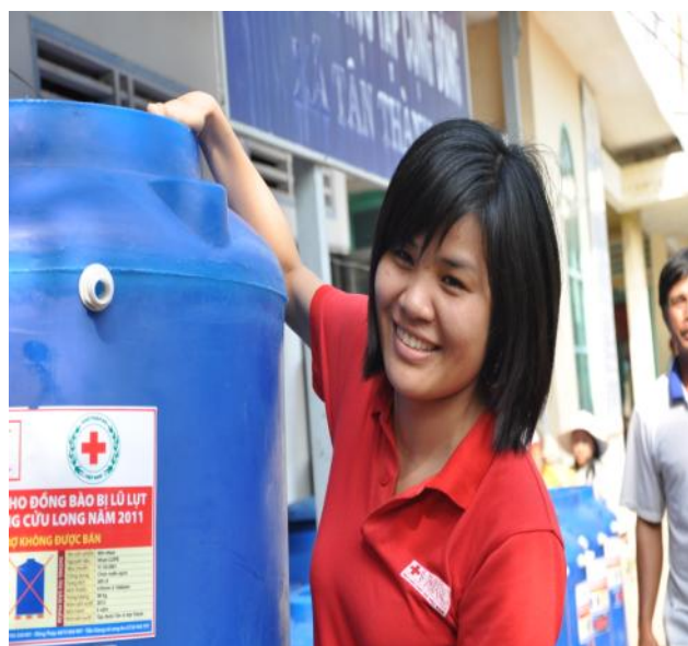
The distribution of water storage tanks was made to 1,200 households in ten communes across eight districts in the three provinces of An Giang, Dong Thap and Long An, all of which were among the worst-hit by these floods.

The distribution of water tanks was done together with a demonstration of household water treatment and instructions on the use of water purification tablets by trained volunteers. In total, 1,200 families have received plastic water storage tanks of 300-litre capacity.