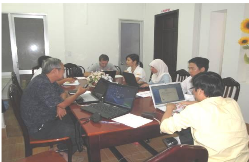
VNRC representative officers sit together with IFRC and DWF in discussion of the shelter programme processes and procedures.

Taking into consideration lessons learned from the Ketsana operation in 2009-2010, VNRC, supported by IFRC, have focused as part of the Mekong floods operation to invest further in building technical human resource capacity at provincial and district levels in the area of shelter programming. As a result, a shelter team was established, consisting of shelter focal persons in each of the three provinces along with a shelter coordinator positioned in Ho Chi Minh City, thus, encouraging greater ownership in the operational planning, implementation monitoring and evaluation.