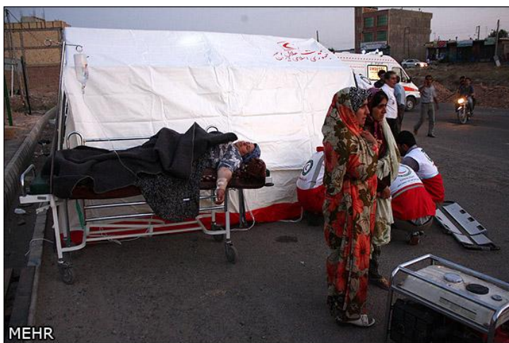
Iranian Red Crescent deployed its emergency response team providing vital life saving activities, Photo: Hamed Nazari/ Mehr news agency

Iranian Red Crescent teams were deployed to the scene providing search and rescue, first aid, emergency health and relief services.