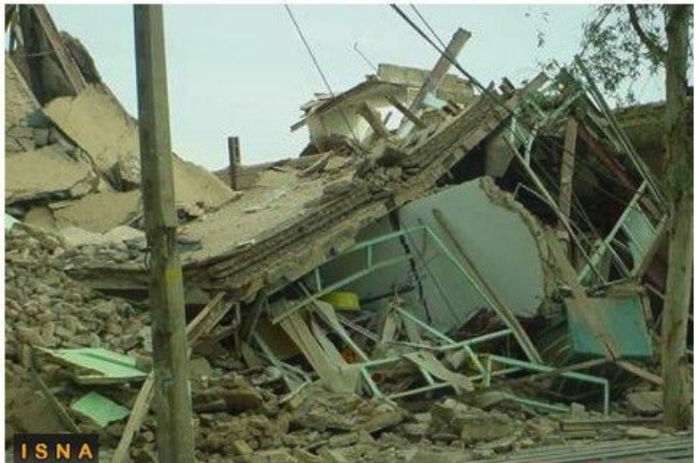
The Earthquake affected Hundreds of houses forcing people to look for temporary shelters

Emergency workers have been mobilized from 14 provinces around Iran for assistance, benefitting from services and resources built up through the ICRC's long experience in dealing with seismic instability.