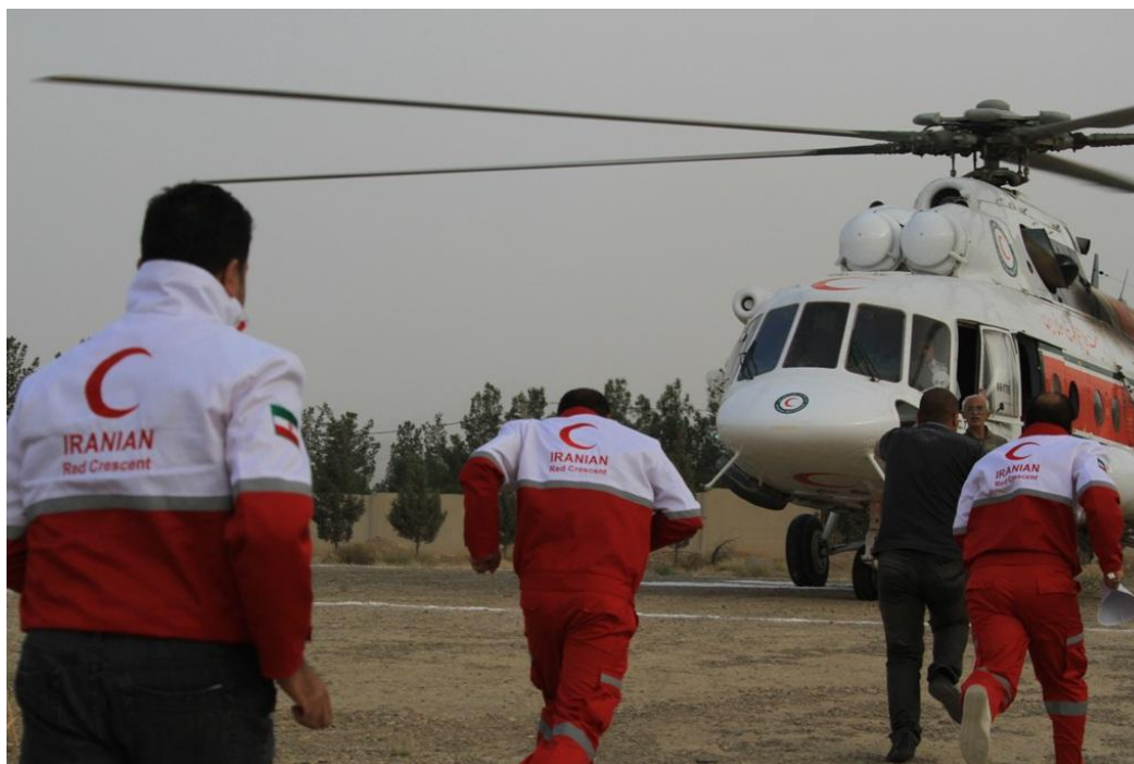
Iranian Red Crescent deployed its emergency response team providing vital life saving activities, Photo: courtesy of the Iranian Red Crescent

This bulletin is being issued for information only, and reflects the current situation and details available at this time. The Red Crescent Society of Islamic Republic of Iran (IRCS), has determined that external assistance is not required at this moment, and is therefore not seeking funding or other assistance from donors and the International Movement of Red Cross and Red Crescent Societies at this time.