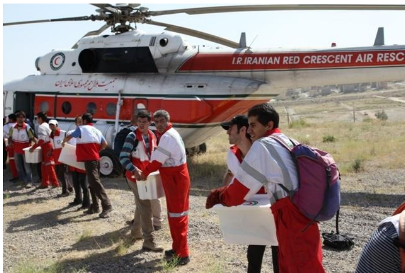
Iranian Red Crescent volunteers and staff teaming to provide the most vulnerable people with relief items.