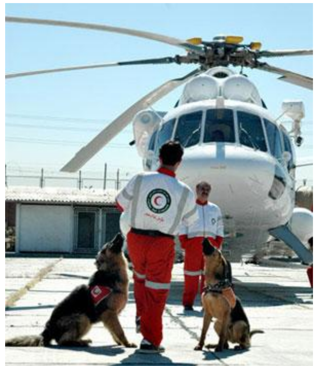
Iranian Red Crescent volunteers geared with sniffer dogs during rescue operations following the earthquake.