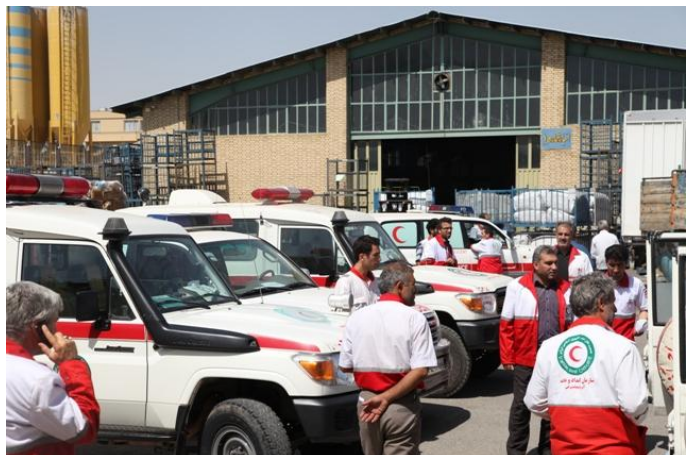
Iranian Red Crescent volunteers during rescue operations following the earthquake.