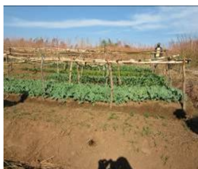
Photo of new crop yield as a result of agricultural inputs provided through this operation in Bie Province.

Summary: The Angola Red Cross Society (ARCS) implemented this food insecurity operation in Huambo, Bie and Kwanza Sul and due to the poor response to the Appeal, ARCS prioritised procurement of seeds, fertiliser and agricultural inputs, and provided community-based health and first aid (CBHFA) to communities through training given to volunteers. Municipal authorities, ARCS staff and volunteers collaborated during the planning phase, as well when distributing the agricultural inputs. Initially the Appeal expected to support 12,000 households, however due to inadequate funding, only 1,566 household were reached in three Provinces: 700 in Bie, 700 in Huambo and 166 in Kwanza Sul. In Huambo and Bie besides health and agriculture technical training, beneficiaries also received seeds and fertilisers. In Kwanza Sul besides health training, agricultural inputs were distributed. Within the three Provinces supported, Kwanza Sul had the most affected community (situated in Porto Amboim), with the highest number of children under five years with malnutrition. In this area, local government prioritized distribution of foods, seeds and fertiliser for this community. During the coordination meeting with local partners and Government, ARCS took responsibility for health training and agriculture inputs.