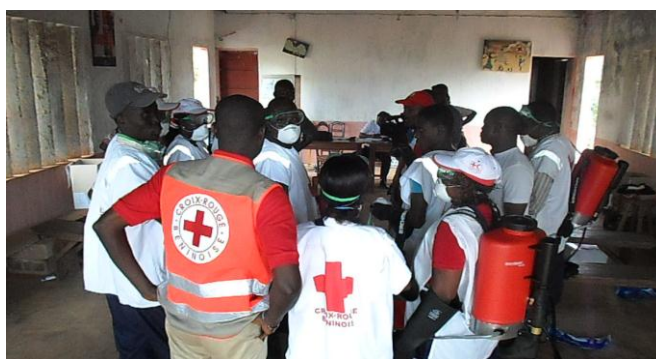
Volunteers were briefed before going to the field.

The operation was conducted in cooperation and good understanding between the RDRT deployed, BRCS water and sanitation focal point and the team of local branch and in strong collaboration with local health authorities who accompanied the National Society in the implementation and monitoring of