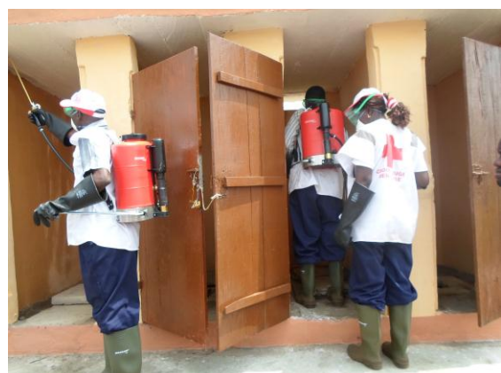
Disinfection of latrines were carried out.