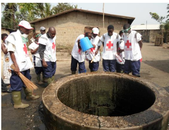
Treating a well.

Some people are resistant to change or accommodate messages delivered through the promotion of good hygiene practices.