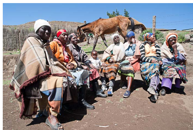
Affected food insecure communities dressed for the cold of the Lesotho Highlands, Photo: British Red Cross

Summary: Agricultural production has dramatically decreased across Lesotho in recent months and severe food insecurity is affecting all ten districts of the country, including the mountainous areas, the foothills and the lowlands. More than 725,000 people are at serious risk of food insecurity. This year's crop failures follow poor harvests last year, and the two consecutive years of reduced crop yields have increased the vulnerability of many of the country's poorest farmers. While food insecurity and chronic vulnerability to hunger are unfortunately common in rural Lesotho, poor soil and the cumulative effect of the two bad harvests have pushed people into negative coping strategies and many have resorted to selling assets, taking children out of school and reducing meals.