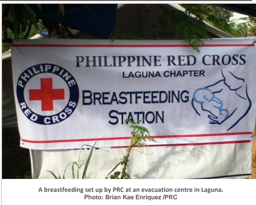
A breastfeeding set up by PRC at an evacuation centre in Laguna.

The distribution of hygiene kits was completed during the reporting period, with all the targeted 10,000 families having received the kits. Assessments were undertaken to identify families in need of additional relief, specifically in areas along Laguna Bay that remain flooded. The assessments identified 950 families that remain evacuation