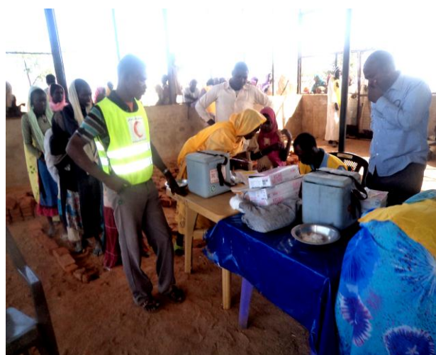
SRCS volunteers mobilize the community and participate in the vaccination campaigns in West Darfur state.

All activities planned under this operation have been carried out. An unspent balance of CHF 31,142 has been returned to DREF.