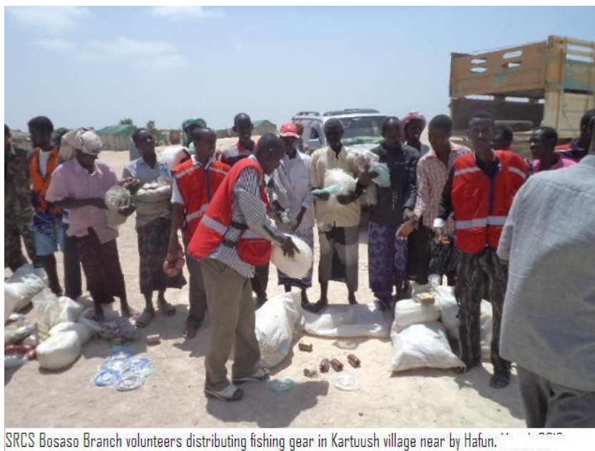
SRCS Bosaso Branch volunteers distributing fishing gear in Kartuush village near by Hafun. 11 April 2013

Summary: The IFRC Somalia Representation and the Somali Red Crescent (SRCS) are seeking to increase the appeal budget within the current time frame of the Appeal, to allow for the completion of water sources development and rehabilitation activities.