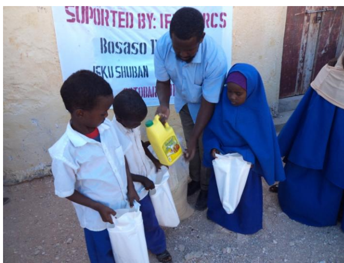
School children in Iskushuban village, Bari region receive food rations from SRCS Bosaso branch, Photo by SRCS.

Two new dormitories were constructed, four classrooms rehabilitated and furnished with 50 desks, three latrines for boys and two for girls rehabilitated together with a dining hall for a school in Galkayo, Puntland that caters for orphaned children. This was to enable the children to remain in school reduce drop-out rate due to lack of secure accommodation, space and food.