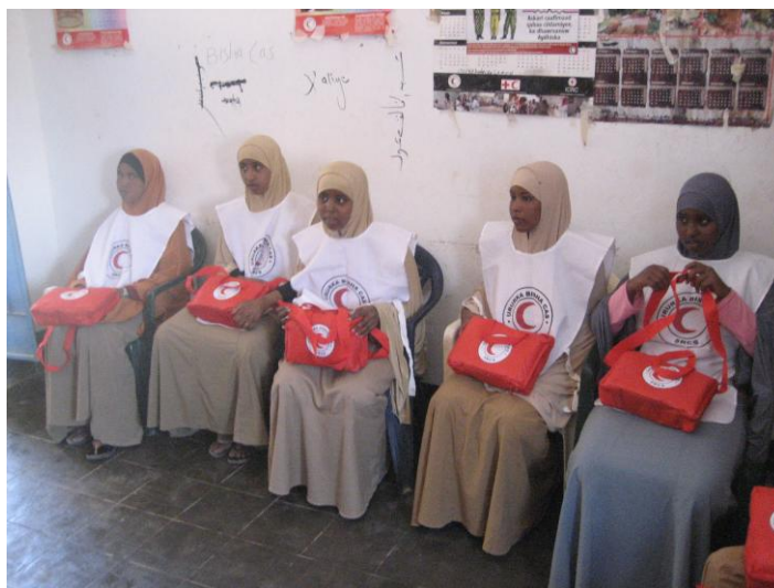
SRCS Qardo sub-branch volunteers in Bari region, Puntland receive First Aid Kits

The operation was led by the SRCS branches and sub-branches in the respective regions where outreach activities were scaled up through mobilization of the health staff and volunteers using the existing clinic facilities and mobile health clinics.