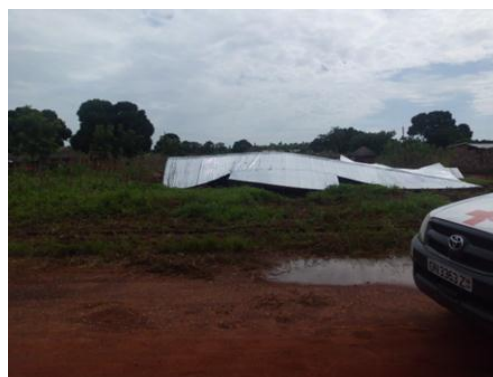
A collapsed house in Bunkpurugu.

As a result of three days of the continuous torrential rains on 29 August 2013 in Bunkpurugu/Yunyuo district, 28 communities were affected displacing 6,021 people whilst 805 houses 538 acres of farmlands were destroyed. Some of the displaced persons who were occupying school buildings as temporary shelter in the wake of the floods are now living with relatives and friends as schools have reopened. Some of the affected people have also started removing the nails from the damaged iron sheets, whilst those with thatched roofing have also supported the badly damaged walls with sticks to prevent them from falling.