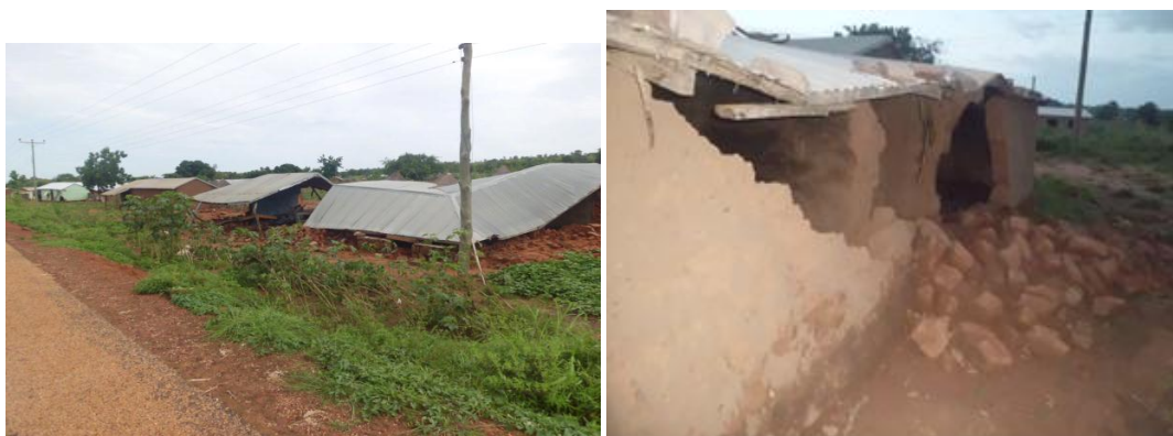
Damage caused as a result of torrential rains.

The GRCS is assisting NADMO in delivering relief items and assessments are ongoing to assess further needs and plan the adequate support for the affected and vulnerable people.