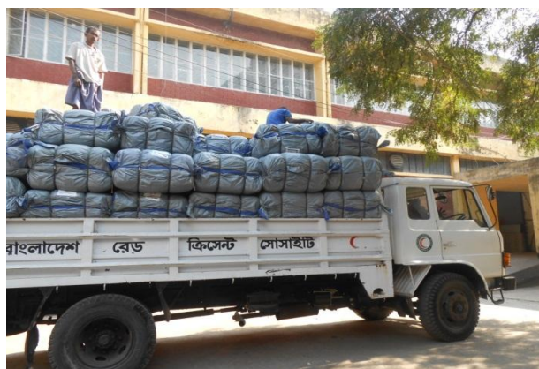
Blankets being dispatched from BDRCS/IFRC joint disaster preparedness stock in the national headquarters' warehouse.

Bangladesh experienced cold weather (temperature dropped to 7°C - 9°C) since mid-December 2012, affecting the poor people in particular in 22 districts (Panchagarh, Thakurgaon, Dinajpur, Nilphamary, Lalmonirhat, Rangpur, Kurigram, Gaibandha, Bogra, Joypurhat, Naogaon, Nawabganj, Rajshahi, Natore, Sirajganj, Pabna, Mymensing in the north, Moulvibazar in the east and certain districts in the south, namely Kushtia, Jessore, Faridpur and Madaripur) 1 . The average temperature recorded in the cold affected area was between 16°C - 25°C during the December and January period. The cold wave struck the northern districts