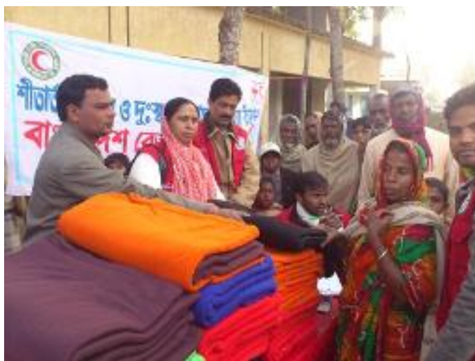
Blanket distribution in Jamalpur district by BDRCS district unit.

Distribution had begun with 30,000 blankets mobilized from BDRCS/International Federation of Red Cross and Red Crescent Societies (IFRC) joint disaster preparedness stock and BDRCS's own stock. Following a call for deployment, ten national disaster response team (NDRT) members were deployed on 5 January 2013 for ten days to assist BDRCS concerned units in beneficiary selection and distribution. During the distribution, BDRCS/IFRC conducted a needs assessment in the most affected districts. Report of the assessment has been shared with the humanitarian country task team (HCTT) as a reference for humanitarian response decision by the response agencies to increase the assistance coverage. With the help from NDRT, the BDRCS district units have completed distribution of 30,000 blankets from DREF contribution by 17 January 2013. Apart from DREF contribution BDRCS distributed another 14,000 blankets received through in-kind donation (IKD) from the in-country Movement partners, business community, corporate sectors and individuals. Process for replenishment of 30,000 blankets is in progress.