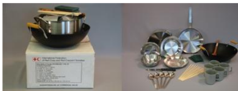
IFRC kitchen sets.