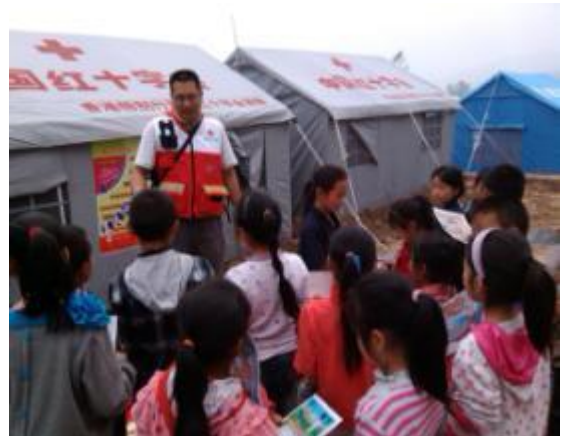
Hygiene promotion conducted for children in temporary settlement sites.

The mass sanitation ERT supported by the DREF completed its mission, with the second rostered team arriving in Lushan on 4 May, and staying on for 12 days. They set up an additional 69 new latrines on top of the 98 latrines built by their preceding team. A total of 167 latrines were built by Yunnan mass sanitation ERT. Before their exit on 14 May, ERT members handed over 158 latrines to Lushan County Red Cross branch and remaining nine latrines to the local authorities for operation and maintenance.