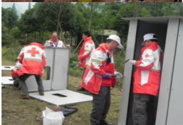
RCSC water and mass sanitation ERTs distributing safe and clean water and setting up hygiene latrines in most-affected areas.