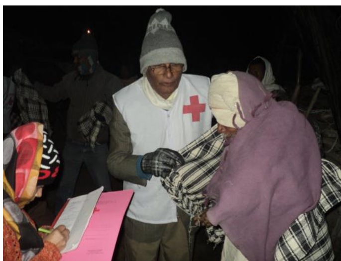
Distribution of blankets by Red Cross volunteers in Patna, Bihar.

The Netherlands Red Cross/government SEF contributed CHF 52,939 and Canadian Red Cross/Canadian International Development Agency (CIDA) contributed CHF 13,957 to the DREF in replenishment of the allocation made for this operation. IFRC, on behalf of the National Society, would like to extend thanks to all for their generous contributions. Details of the contributions to the DREF can be found on www.ifrc.org/dref .