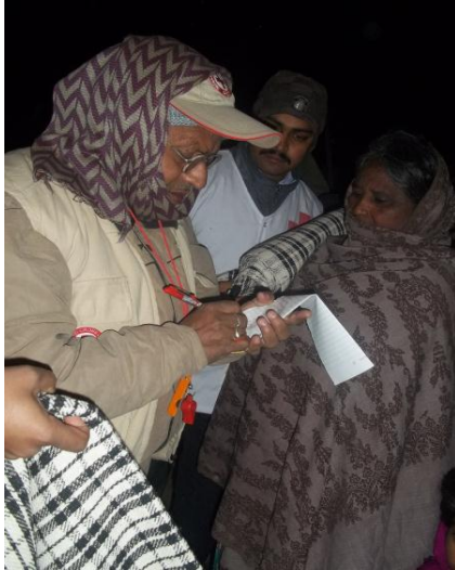
Indian Red Cross Society volunteers and national disaster response team members partaking in the distribution of blankets.