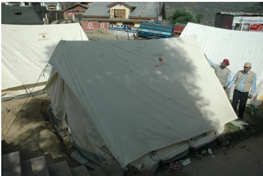
IRCS tents being set up in Doda district by Red Cross volunteers for earthquake affected families, Photo: Indian Red Cross Society.

CHF 258,670 has been allocated from the International Federation of Red Cross and Red Crescent Societies' (IFRC) Disaster Relief Emergency Fund (DREF) to support the Indian Red Cross Society (IRCS) in delivering immediate assistance to some 10,000 beneficiaries (approximately 1,000 families). Unearmarked funds to repay DREF are encouraged.