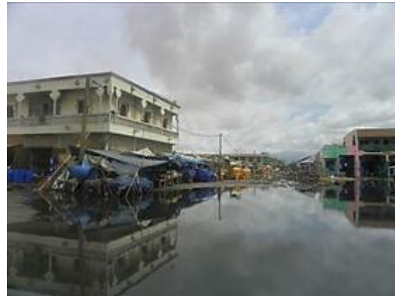
The biggest market in Nouakchott the Capital, totally flooded.

<click here for the DREF budget; here for contact details; here to view the map of the affected area>