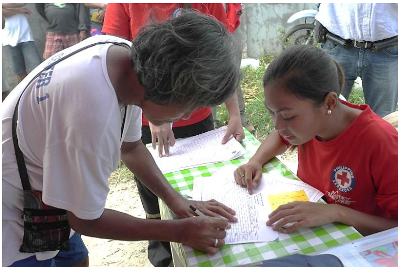
In Maya, Cebu, a Red Cross volunteer guides a beneficiary through the registration and verification process. As of 27 December, Philippine Red Cross, with the support of the Red Cross/Red Crescent, has reached more than 95,263 families with non-food items.

The first urgent priority of the National Society has been to deliver food and essential non-food items (NFI) to people in the worst affected areas. Rapid assessments were conducted concurrently with distributions to ascertain the scale and scope of the emergency. Assessments continue to be refined, and activities re-oriented, as access to isolated areas improves and communication systems are restored.