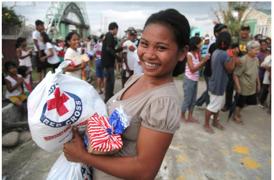
A resident of Dagami, Leyte, receives food relief from the Philippine Red Cross (PRC). As of 27 December 2013, PRC had distributed up to 212,160 food parcels reaching approximately 1,060,800 people.

Since the disaster, the priority of the National Society has been to deliver food and essential household items to people in the worst-affected areas as quickly as possible, while conducting assessments to obtain a clear picture of