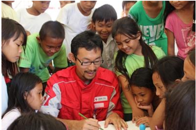
Psychosocial activities not only comprise taking care of individual needs, they focus on bringing communities together and helping people to regain a sense of normality in their lives. Photo: Japanese Red Cross Society - health clinic in Maya, Cebu

Building on the recovery position paper, an operational strategy is being finalized by PRC which outlines the recovery principles, approaches and good practice including integrated and mutually supportive programme delivery with strong coordination within the Red Cross Red Crescent response and with external partners, particularly local government and other humanitarian agencies. Emphasis will be on meeting context specific recovery needs of the most vulnerable and avoiding duplication with other assistance providers. The importance of addressing gender needs, accountability to those being assisted and incorporating risk reduction and resilience building approaches, leading to safer communities, will be prioritized. Consolidated reporting systems including common monitoring indicators agreed by all Red Cross Red Crescent partners will allow for the collation of comparable results and consolidated reporting on impact.