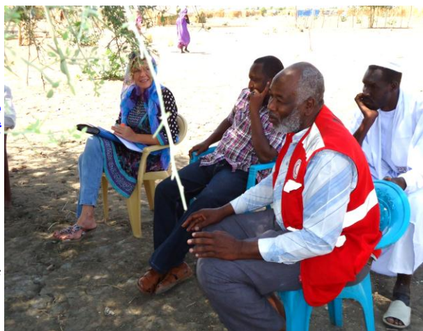
Group discussion with representatives of IDPs from Bao, now settled at the outskirts of Al Damazien in Blue Nile (Field visit of the Evaluation team on 10 May 2013)

Summary: Through this appeal, the IFRC aims to support the SRCS Branches and National Disaster Response Teams (BDRTs and NDRTs) to respond to acute humanitarian needs of disasters through provision of rapid and effective lifesaving assistance to an estimated 150,000 beneficiaries, with particular focus on internally displaced people across eleven disaster prone states of Sudan (the five states of Darfur, Blue Nile, South Kordofan, North Kordofan, White Nile, Sennar and Khartoum states). The appeal also aims to consolidate the capacities of the National Societies and its branches and promote humanitarian diplomacy in building peace and promotion of the Red Cross Red Crescent Fundamental Principles.