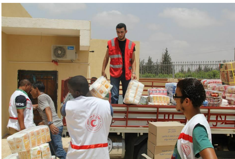
LRCS staff and volunteers unloading relief items to displaced families in Tripoli.

This bulletin is being issued for information only, and reflects the current situation and details available at this time. The Libyan Red Crescent Society, with the support of the International Federation of Red Cross and Red Crescent Societies (IFRC), has determined that external assistance is not required, and is therefore not seeking funding or other assistance from donors at this time.