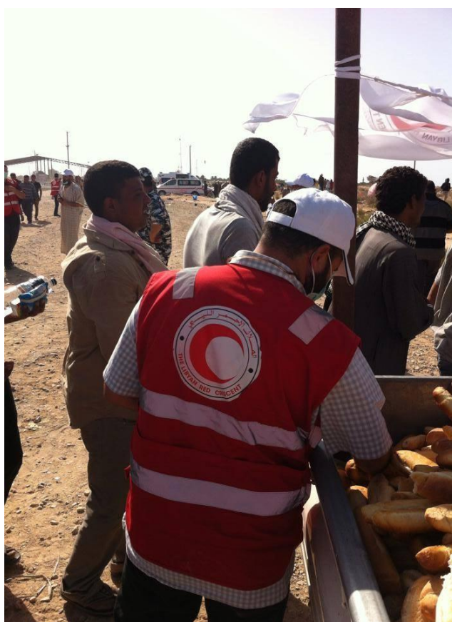
LRCS Volunteers distributing food and water for the stranded at the borders.

The IFRC is in continuous contact and communication with the Libyan Red Crescent Society (LRCS), and the Tunisian Red Crescent Society (TRCS), monitoring the situation. Urgent funds were made available to the TRCS to respond immediately to the urgent food aid needed on the border. TRCS trained volunteers have been deployed to the border area. TRCS teams will work