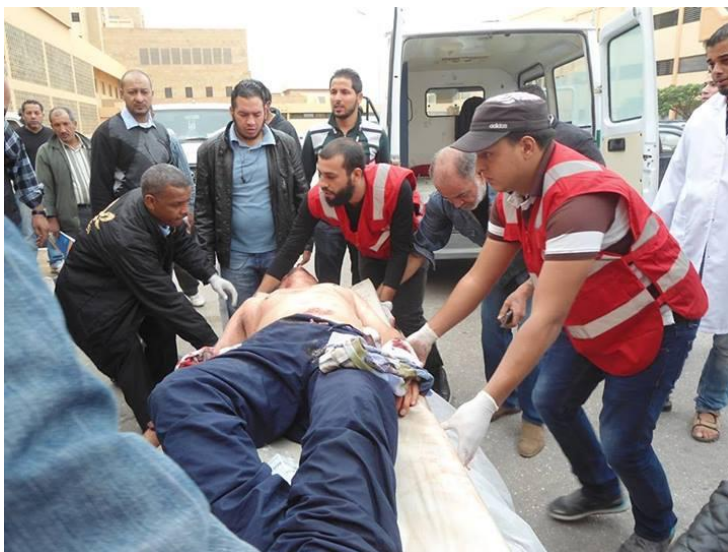
Figure 1 LRCS medical teams were immediately deployed in the affected areas in Benghazi.

In Libya, The Libyan Red Crescent Society (LRCS) staff and volunteers are on high alert since mid-May 2014. The ongoing fighting has caused hundreds of injuries. LRCS first aid teams are on the ground, providing vital lifesaving services such as first aid and medical transportation to hospitals. The communication and information team of the national society has issued a public statement stressing the need to respect the Red Crescent emblem especially after the minor damage caused to the LRCS hospital " Ibn-Sina" in Benghazi due to the on-going clashes.