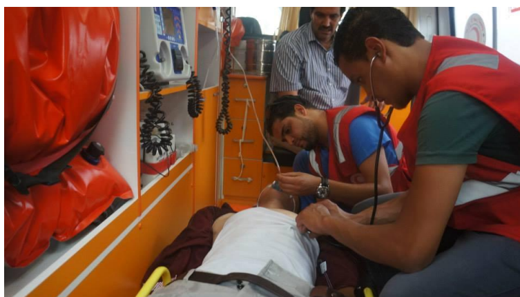
Libyan Red Crescent volunteers provide firstaid services to an injured citizen from Benghazi .

<click here to view the map of the affected area, or here for detailed contact information>