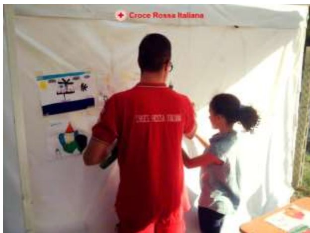
Italian Red Cross volunteers providing PSS for children.

On 30 August 2016, the Civil Protection reported 3,554 people have been assisted and are being accommodated in camps.