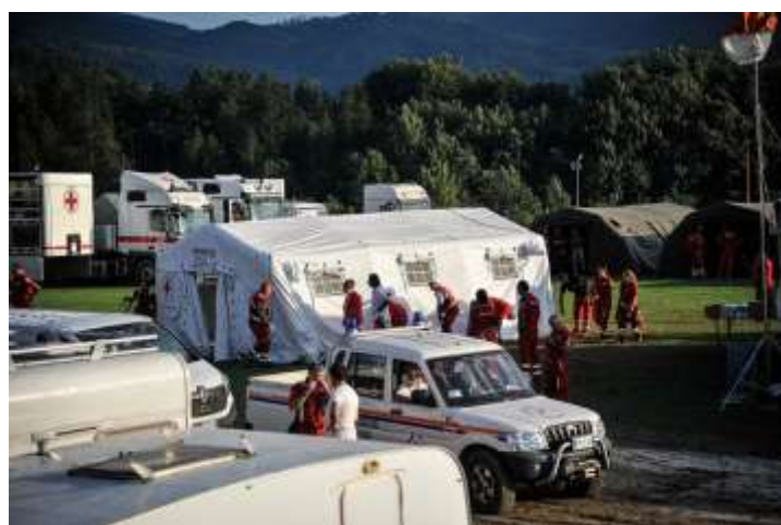
Italian Red Cross operation centre in Amatrice.