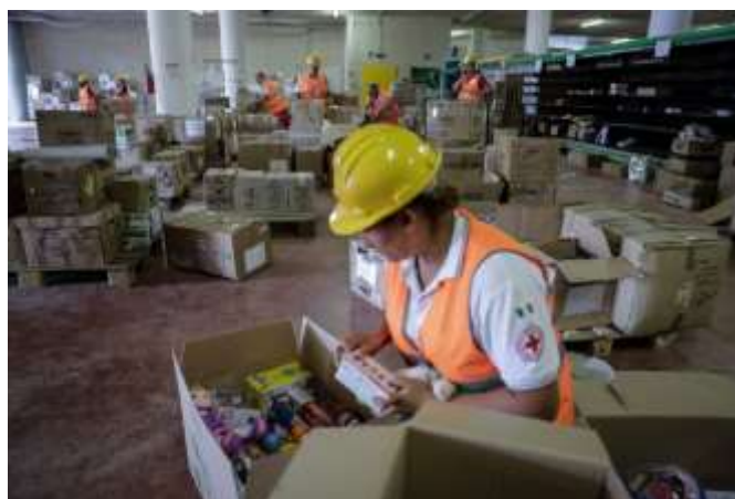
Italian Red Cross volunteers preparing relief items.

Thousands of homes, buildings and infrastructure have been destroyed or damaged by the 6.2 magnitude earthquake that struck central Italy. The Italian Red Cross in coordination with the Civil Protection deployed rescuers with specialist equipment and sniffer dogs to the affected areas, and more than 450 volunteers are currently on the ground providing emergency supplies, first aid and psychosocial support to people affected by the disaster.