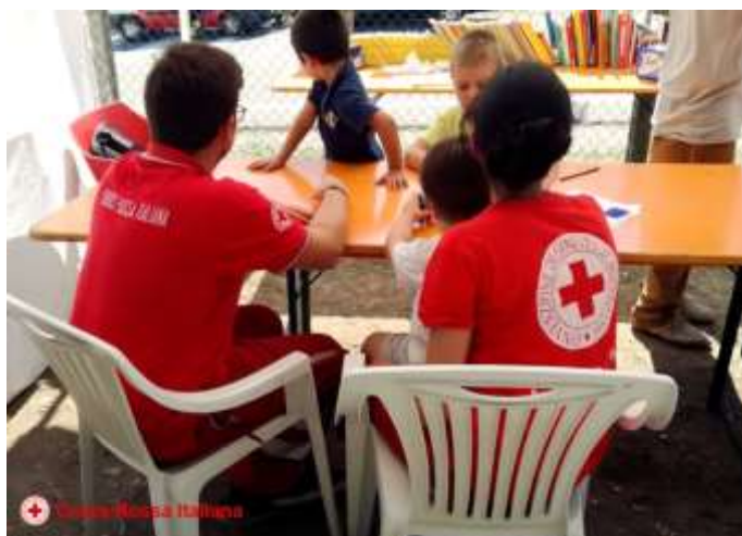
Italian Red Cross volunteers conducting activities with affected children.

This bulletin is being issued for information only and the Italian Red Cross is not requesting international assistance. However, if National Societies wish to contribute to the Italian Red Cross operation, please contact the National Society directly on the below contacts.