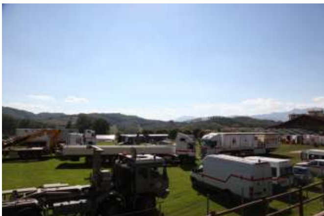
Italian Red Cross operation centre in Amatrice.

This bulletin is being issued for information only and the Italian Red Cross is not requesting international assistance. However, if National Societies wish to contribute to the Italian Red Cross operation, please contact the National Society directly on the below contacts. This will be the last update on the situation.