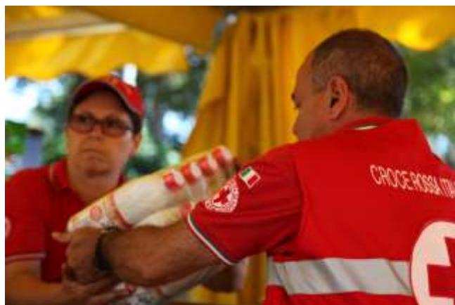
Italian Red Cross volunteers preparing for distribution of relief items.