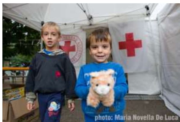
Recreational centre for children, in Grisciano, near Accumoli.

The Italian Red Cross has raised over 700,000 Euros through online donations from 32 countries and thanks to contributions from corporations. On 27 August, iTunes launched a campaign in Italy and on 1 September in an additional 16 markets through the App Store.