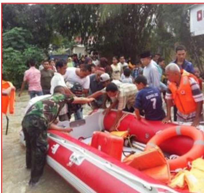
Red Cross volunteers participate in the evacuation of affected people in Kampar district, Riau province.

In the province of Aceh, flooding has affected 3 districts (Aceh Besar, Aceh Utara and Pidie), isolating 1,799 households.