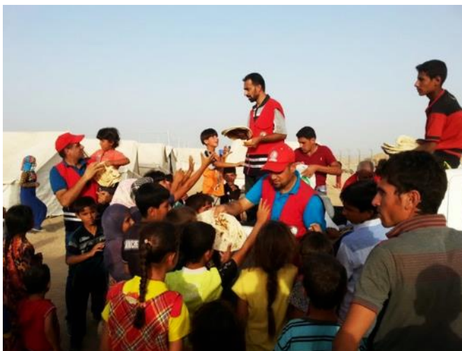
Red Crescent volunteers distribute bread to families displaced from Fallujah.

In and around Nineveh governorate, Iraqi security forces have continued an offensive to retake territory which in recent days has resulted in the displacement of thousands of people both within and into Saladin and Kirkuk governorates . More than 8,400 people have been displaced from the town of Shirqat and surrounding areas alone. Due to the rapid movement of people, the total number who have been displaced may in fact be much higher. It is currently estimated that around 200,000 civilians remain in the Shirqat city, which is under the control of non-state armed groups. Displaced families and individuals are in dire need of safety, shelter, water, food and health care.