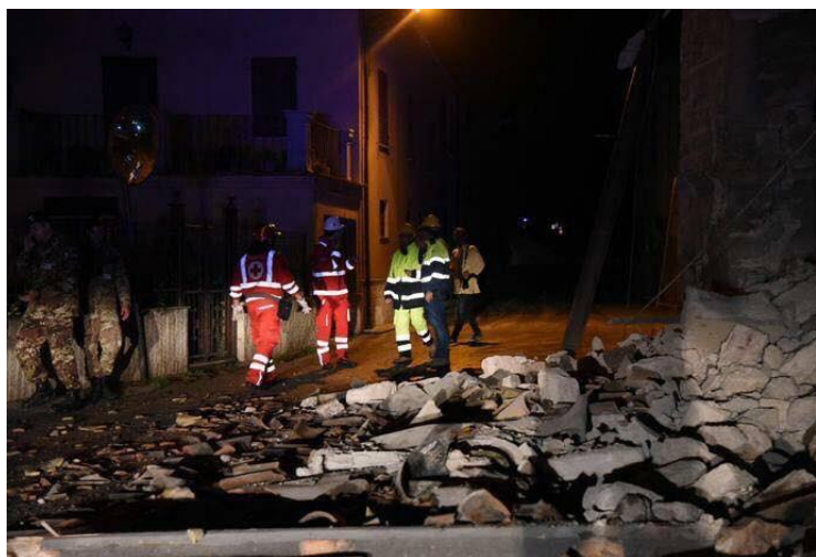
Red Cross teams assessing the damages jointly with Civil protection in the town of Visso.

The National Society's regional branches of Umbria, Marche, Lazio and Abruzzo are on standby to take action as necessary and needed, and the President of the Italian Red Cross Marche branch is in the affected area right now.