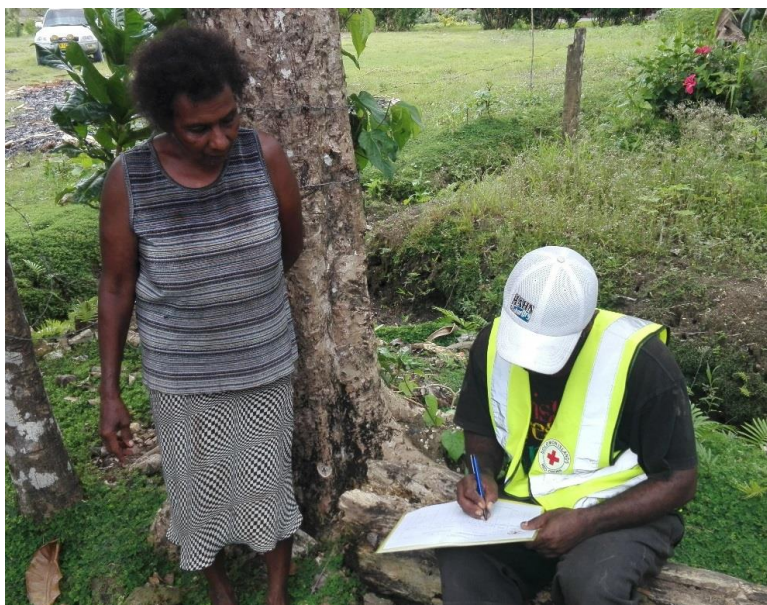
One of the response volunteers interviewing a woman at Oibola village in Malaita. Auki Branch has begun distributing NFIs to households that are affected.

SIRC launched a disaster management information system (DMIS) entry and has been in contact with IFRC country cluster support team (CCST) office in Suva and the Partner National Societies present in country. Australian Red Cross (ARC) communications department was alerted and put on standby for communications surge capacity. New Zealand Red Cross assisted with the activation of satellite phones in country to enhance communication resources. French Red Cross and ARC who are both present in country have been briefed on the situation and are working closely with SIRCS and IFRC in supporting the planning for potential response.