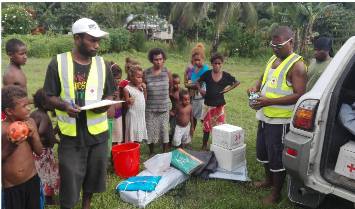
SIRCS Auki Branch doing distribution to families whose homes are destroyed by the earthquake at Oibola village in Malaita Province. Items distributed include Tarpaulins, shelter kits, hygiene kits, kitchen sets, solar lamps, mats, blankets, mosquito nets and 10-liter water containers.

IFRC CCST office based in Suva is in close communication with SIRCS to monitor the situation, providing communication updates through various social media and partners updates, and is standing by to coordinate further support as needed working closely with the Asia Pacific regional office.