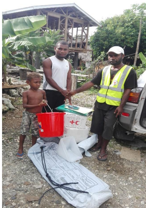
SIRCS Auki Branch volunteers doing interview and inspecting the level of damages sustained by the earthquake that struck most parts of the Solomon Islands on Friday, 9 th December 2016.

In the several hours following the earthquake, the Solomon Islands experienced ten significant aftershocks ranging from 4.5M to 5.5M. The National Disaster Management Office (NDMO) activated its National Emergency Operation Center (NEOC) in the capital city Honiara, where relevant humanitarian actors including UNOCHA are present. An aerial assessment has been conducted by NDMO to provide an overview of damage in the affected areas Malaita and Makira-Ulawa provinces. Results of the aerial assessment will be made available overnight. Meanwhile, initial reports received from the provinces indicate disaster impacts resulting from the earthquake and tsunami, in the summarized table below.