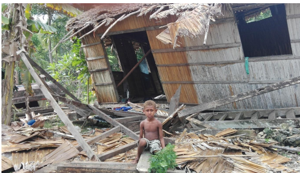
A child sits in front of his destroyed home in Radefasu village in Malaita, one of the communities in the Province that is also affected by the magnitude 7.8 earthquake that struck the Solomon Islands on the early morning of 9th December 2016.

The government has not yet requested for international assistance, but have asked for information on available resources and relief supplies in country from humanitarian actors and UN Agencies with OCHA assisting in compilation of information. OCHA Pacific has indicated to the Director of NDMO outlining the support that can be offered by OCHA and the Pacific Humanitarian Team (PHT) of which IFRC is a member, should the government require international assistance.