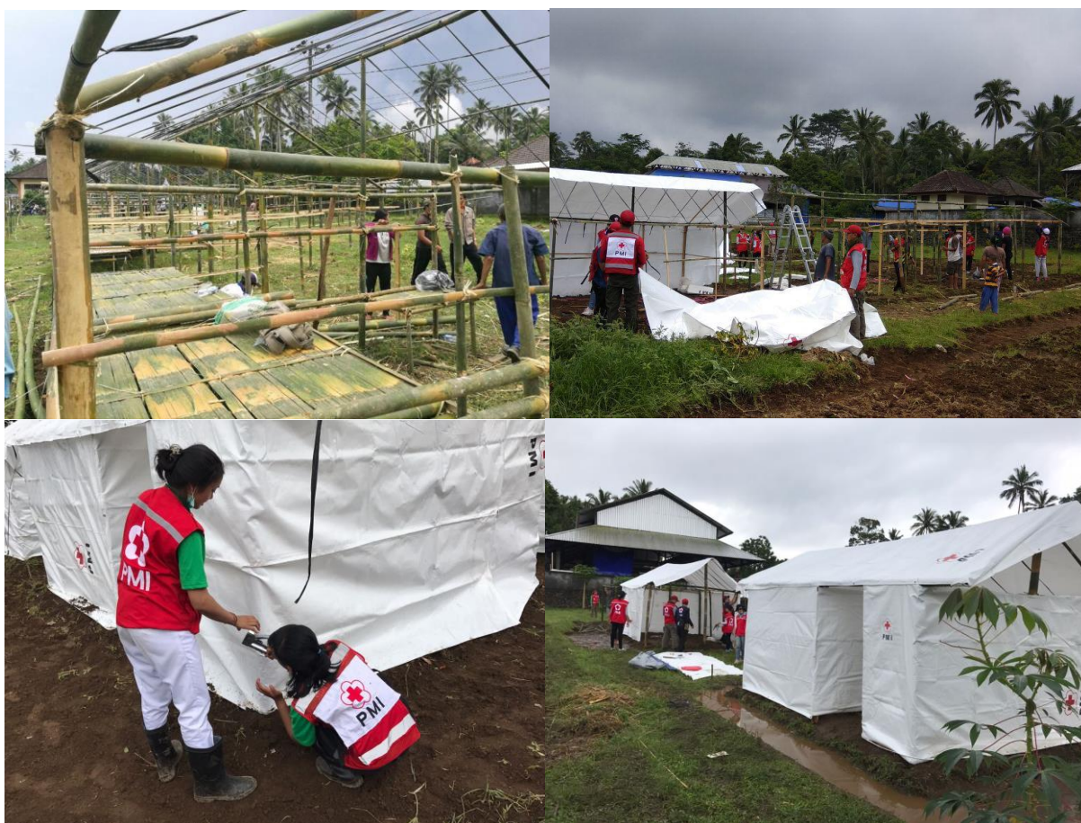
Emergency shelter set up by PMI to provide protection to those who have evacuated.

The Indonesian Red Cross (known locally as Palang Merah Indonesia or PMI) has been active since the 18 September, when the alert level was progressive raised. In support of PMI, the International Federation of Red Cross and Red Crescent Societies (IFRC) released funds from the Disaster Relief Emergency Fund (DREF) on 27 September for CHF 169,320 (IDR 2.3 billion). This operation aimed to support the immediate needs of 7,750 people. A second allocation of DREF was released on 24 November 2017 with the operation plan and budget revised to CHF 210,417 (IDR 2.8 billion). The DREF allocation will support the emergency and live saving needs of 11,000 women and men, girls and boys.