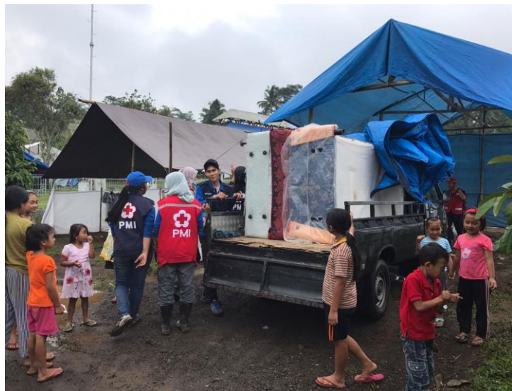
PMI volunteers assist at risk families to evacuate to safe locations. This is the second time in recent months that families have had to pack up and leave their homes.

The ongoing eruption has disrupted school examinations, resulting in thousands of elementary and junior high students forced to sit their examinations at schools near evacuation sites.