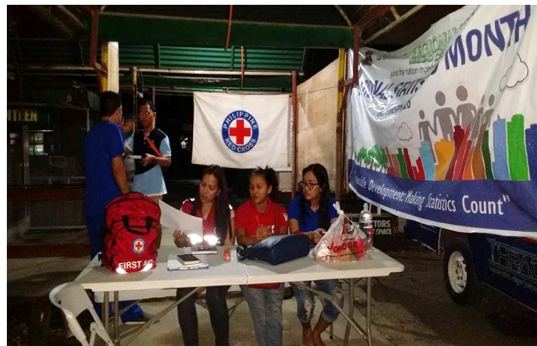
PRC welfare desk at the CARAGA Regional Hospital in Surigao City.

In responding to the disrupted water supply in Surigao City, PRC NHQ has deployed four generators, two water tankers, one water treatment unit and six water bladders to provide safe drinking water. The water tanker, water treatment unit and personnel was deployed from Tacloban City and have arrived in Surigao City today, 12 February. One water tanker with 10,000-liter capacity from Zamboanga City Chapter and two water tankers of similar capacity from Cebu City Chapter are en-route to Surigao City and are expected to arrive on 13 February. Meanwhile, WASH equipment in Davao City, including a 6-wheeler truck, and in Iligan City will also be deployed on 13 February 2017. Coordination with City water district is on-going for the areas to set up the equipment.