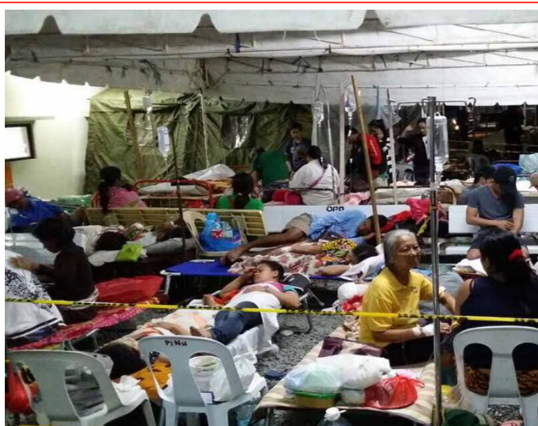
Affected people being treated in the temporary tent setup outside CARAGA Regional hospital.

Surigao City was placed under a state of calamity on 11 February. Search and rescue operations are still ongoing, with multiagency rescue workers involved. The humanitarian impact wrought by the quake is emerging as government teams, Red Cross personnel and emergency responders from other agencies continue to undertake assessments.