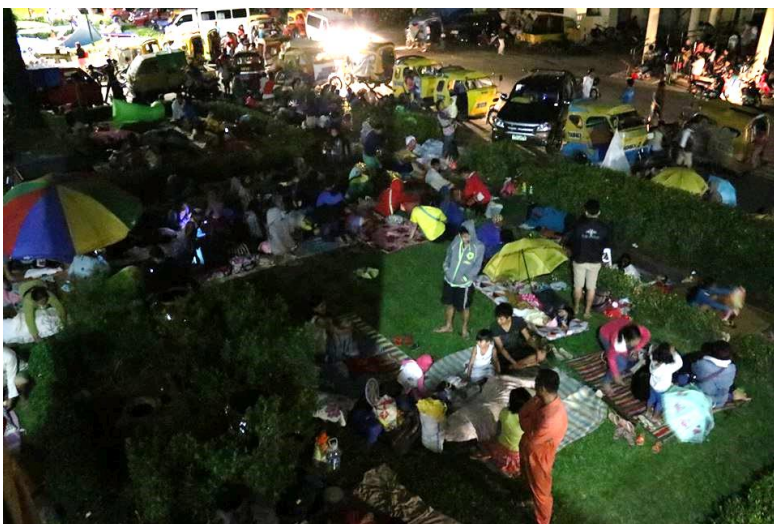
Many of the evacuees are still sleeping in the open outside the capital building.

The assessment teams from Bukidnon Chapter led by trained National Disaster Response Team (NDRT) and Red Cross Action Team (RCAT) members have been mobilized and arrived in Surigao City at 17:00h local time, 12 February. In addition, Davao City Chapter is mobilising additional NDRT and RCAT trained personnel to conduct assessments in areas outside Surigao City. The team is expected to arrive on Monday 13 February.