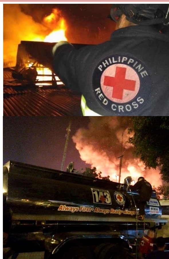
Red Cross staff, volunteers, fire trucks and ambulances were immediately deployed to support the local authorities in putting out the fire.

The Department of Social Welfare and Development and the local government of Manila are assessing the needs of the affected people. The Manila City government has announced plans to release PHP 3 million (approximately CHF 60,000) from its calamity fund to address immediate needs of the affected 3,000 families.