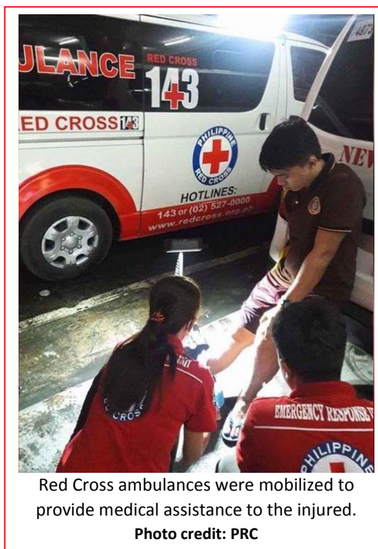
Red Cross ambulances were mobilized to provide medical assistance to the injured.

It is important to note that in March 2015, a blaze tore through the same compound, Parola, leaving more than 1,000 families homeless after their houses were destroyed. The IFRC launched a DREF operation to support the PRC response.