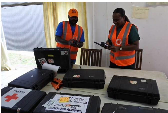
Vanuatu Red Cross staff preparing emergency communication systems for TC Donna

In its effort of engaging with the other partners, VRCS also shared its organigram for EOC for TC Donna with partners. The National Society is also having daily updates on the VRCS Website and Facebook.