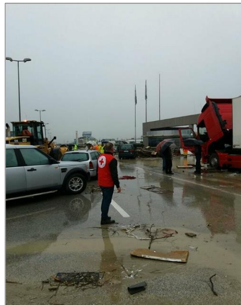
Evaluation on highway Tirana-Durres

The Albanian Red Cross and IFRC have been working to highlight the response efforts across social media and mass media, and provided information on the website and on Twitter .