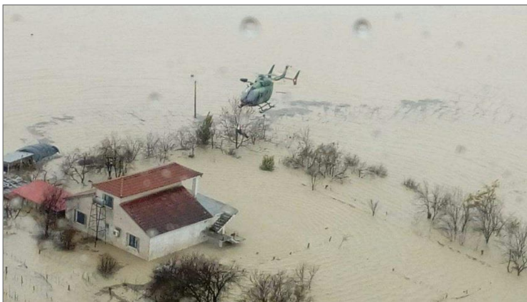
Evacuation in Kruja area.