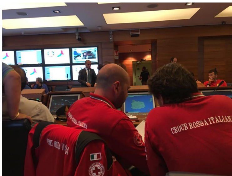
Emergency Operation Centre is activated.

The quake hit a few days before the first anniversary of a powerful quake that killed nearly 300 people in central Italy, most of them in the town of Amatrice.