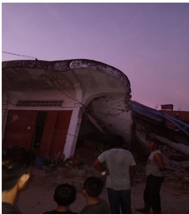
Few hours after the consecutive earthquakes

The impact of the earthquake with the strength of 7.7 on the Richter magnitude scale was felt very hard. Based on INASAFE shake map, it is estimated at least 300,000 people are exposed in Donggala District and it is predicted that the event affected more population in other districts. Some areas in Donggala District including Parigi, Kasimbar, Tobolf, Toribulu, Dongkalang, Sabang and Tinombo regions can feel the tremor. It is estimated that in those areas, there is likely to be considerable damage.