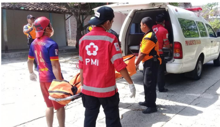
PMI deployed two ambulances and its volunteers to provide immediate assistance to those affected by the earthquake in Lombok District, West Nusa Tenggara Province.

A 6.4 magnitude earthquake has struck off Lombok, province of West Nusa Tenggara, Indonesia, at 05:47h local time, on Sunday 29 July 2018, followed by multiple aftershocks at time of reporting. The earthquake affected the three districts of North Lombok, East Lombok and West Lombok, with 14 casualties reported to date and more than 105 people injured, damaging many buildings and homes and resulting in more than 4,000 people being evacuated (assessment is underway and fixed figures will be shared soon). The quake also impacted Mount Rinjani national park, where a total of 820 mountain climbers – 617 foreigners and 203 locals – were within the area of Rinjani with 554 people evacuated and the rest currently still under evacuation process. Information from the national disaster management agency (BNPB) on damage and number of people/houses affected in Lombok are tabulated below.