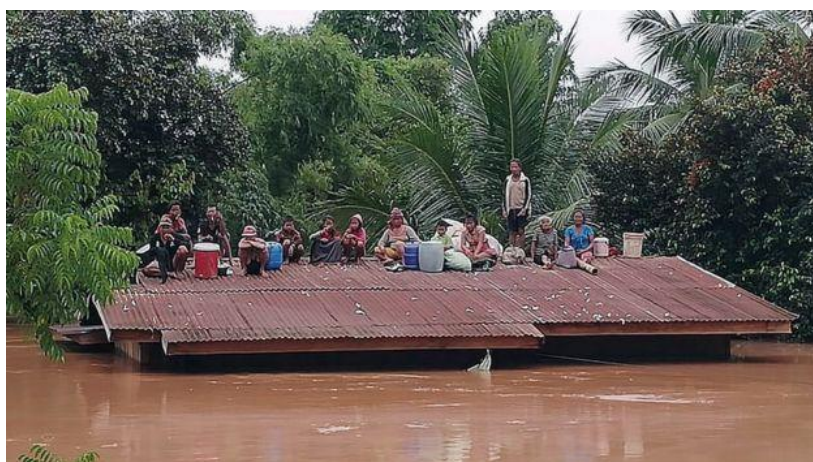
People stranded on the roof top waiting assistance in Attapeu province on 24 July 2018.

The Prime Minister and Member of National Disaster Prevention and Control Committee visited Attapeu and distributed relief items to the affected people.