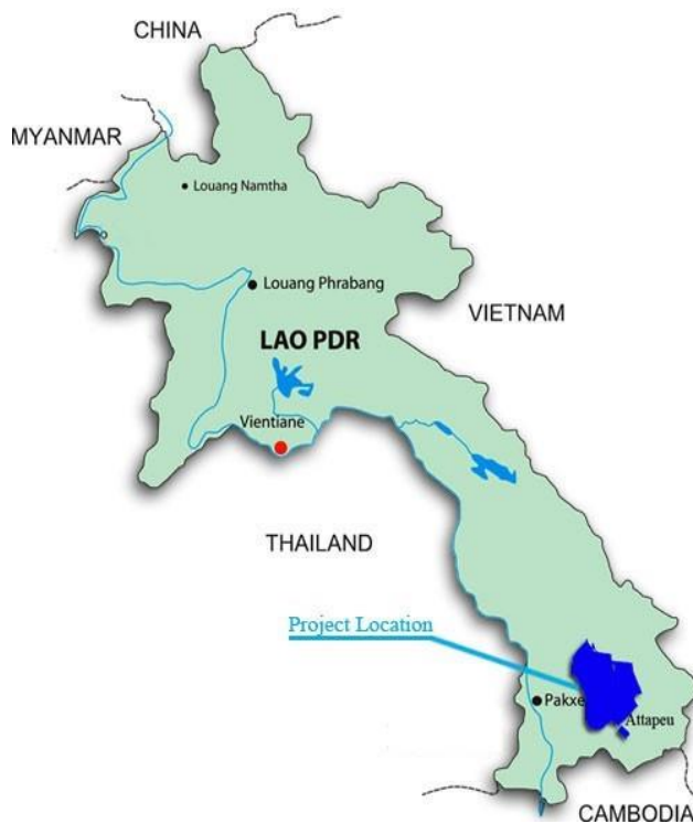
Map shows the location of the dam in Attapeu Province that collapsed on 23 July 2018.

IFRC CCST Bangkok is liaising with the TRCS for logistic and relief support, particularly for supply of food and non-food items from its TRCS provincial Red Cross Chapter located close to Lao PDR. In addition, IFRC stands ready to provide communication and coordination assistance to the Lao Red Cross especially during the early days after the incident. The IFRC through its CCST in Bangkok is preparing to issue Disaster Relief Emergency Fund to enable LRC to increase support to affected people.